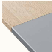
Extension leaf, Grey MDF