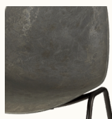
Coffee Waste Dark