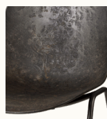
Coffee Waste Black