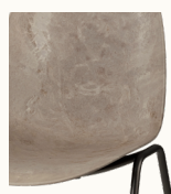
Coffee Waste Light