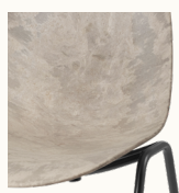
Wood Waste Grey

The Shell of the Eternity Chair is made of Matek®, our patented waste material. Innovative technology allows us to recycle fibre-based waste materials with recycled plastic. Depending on the colourway the waste used for the Matek blend comes from post-consumer e-waste mixed with either wood or coffee waste. The chair itself is a very comfortable chair with industrial and sculptural features and is suitable for both private and public use.